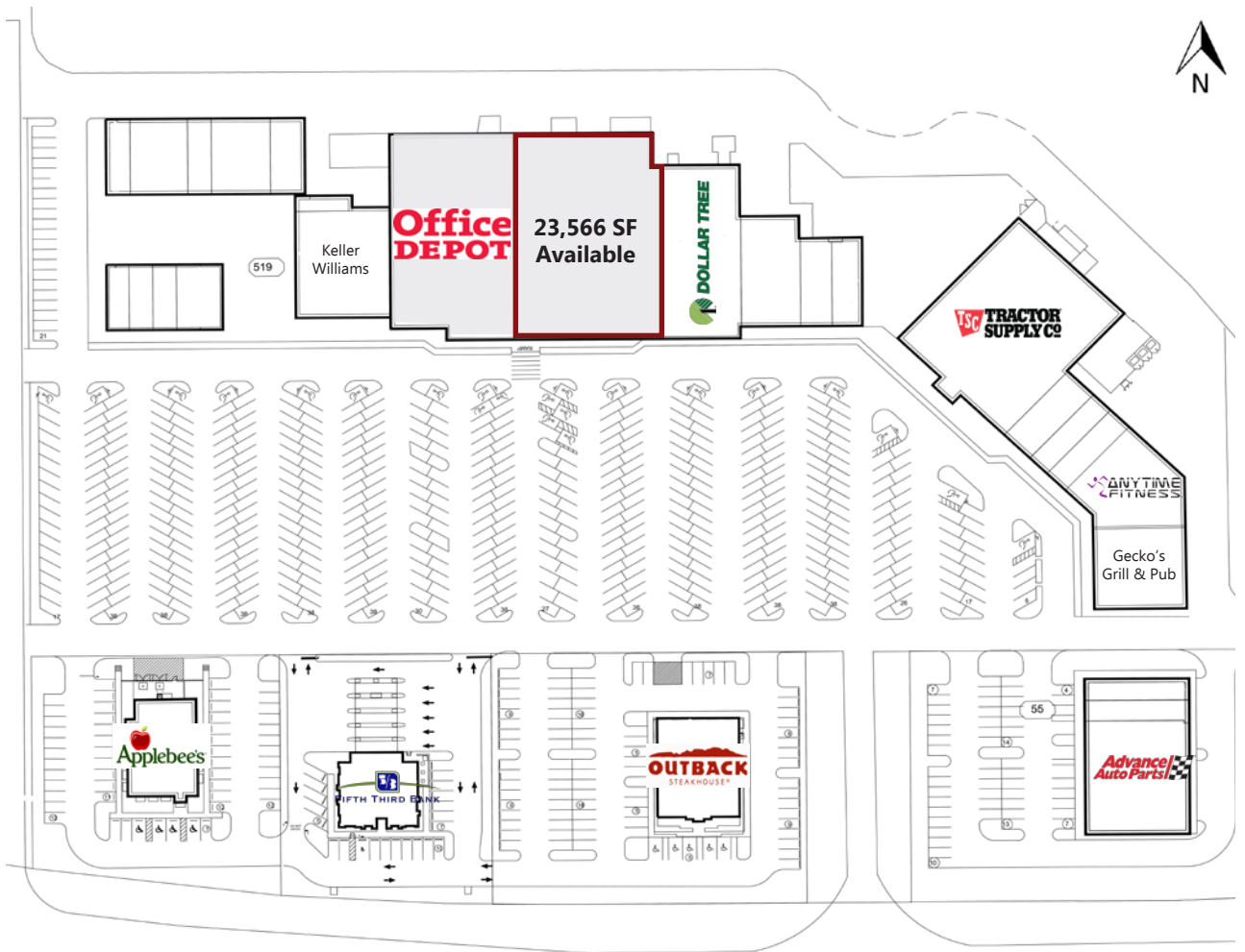
E State Road 64/Manatee Ave (42,500 AADT)